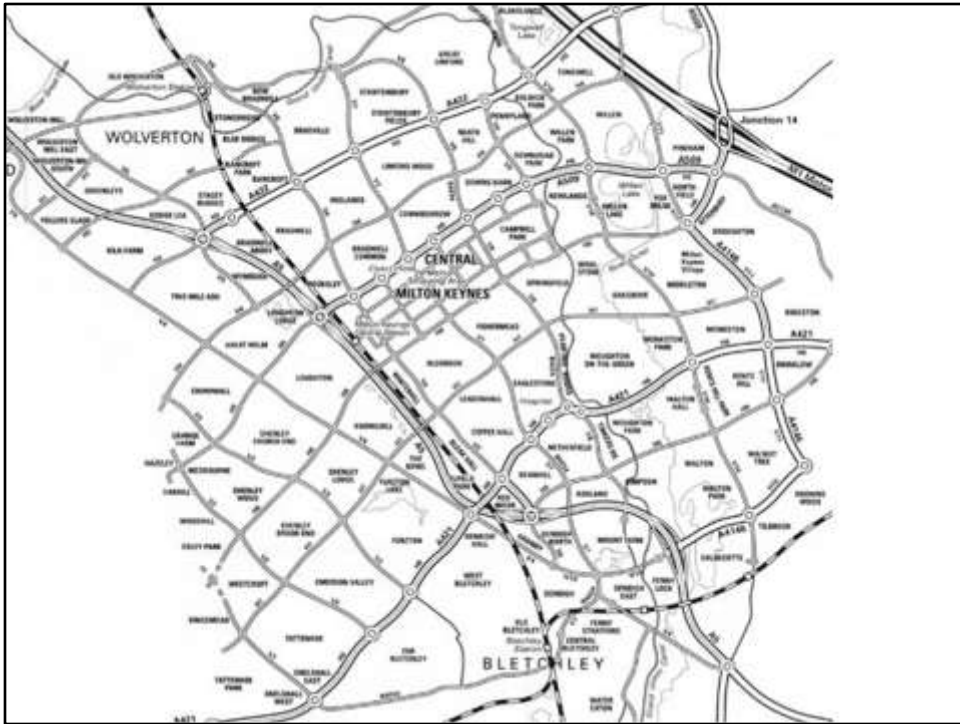
A map of Milton Keynes to get our bearing. Note the old towns: Stony Stratford, Wolverton, Newport Pagnell, Bletchley; the new bits, and Central Milton Keynes